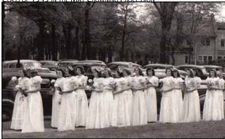
CLASS OF 1949 IN THE MAY CROWNING PROCESSION