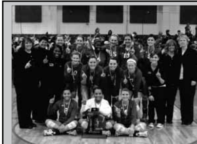
(Above) 2009-2010 State Champion Volleyball team. (Right) The team united before the final game.