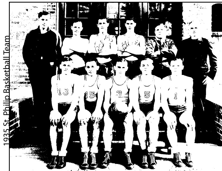
1935 St. Philip Basketball Team